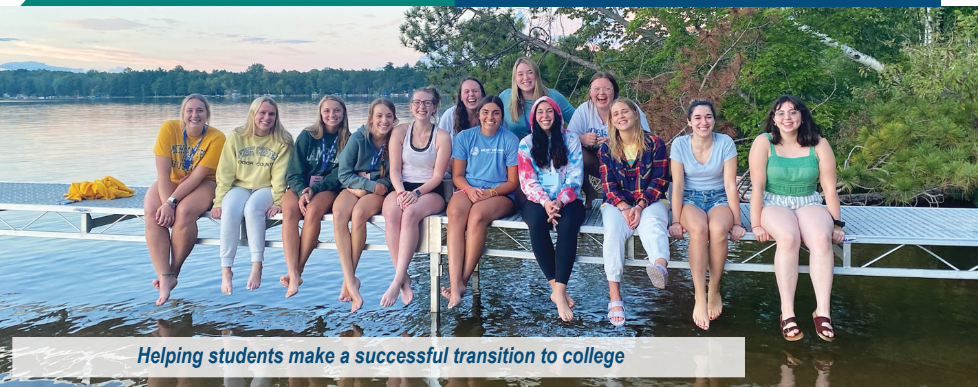
Helping students make a successful transition to college